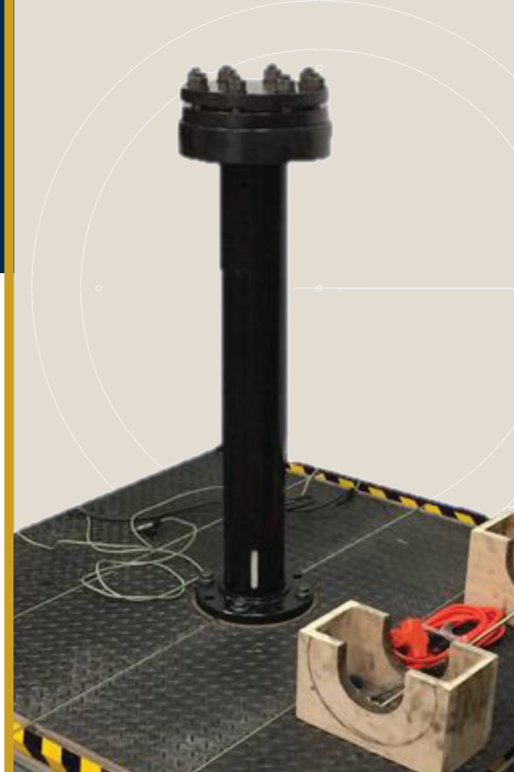
Flange Assembly Demonstration Unit

To schedule a training session or inquire about pricing, please contact: engineering@lamons.com